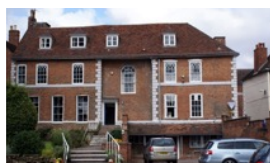
'IN LODGE' EVENTS